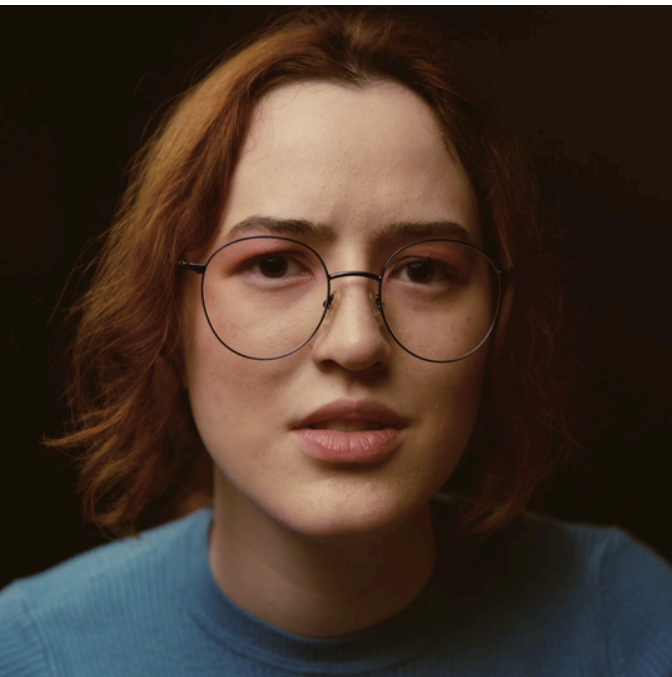
stills from "Can I just tell you?" (short film)